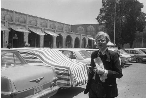
Bob Colacello, Andy with Covered Cars, Isfahan, Iran, 1976 , Gelatin silver print, 16 x 20 inches (40.6 x 50.8 cm); © Bob Colacello; Courtesy the artist and Vito Schnabel Gallery.

period, Holy Terror: Andy Warhol Close Up , was acclaimed by The New York Times, as “the best-written and the most killingly observed” book on the so-called Pope of Pop.