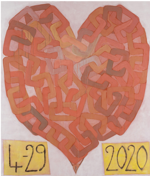
Francesco Clemente, 4-29 2020, 2020, Pigment on canvas, 93 x 78 inches (236.2 x 198.1 cm)