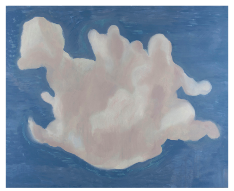
Francesco Clemente, Clouds VI , 2018, oil on canvas, 71 x 87 inches (180.3 x 221 cm); © Francesco Clemente; Courtesy the artist and Vito Schnabel Gallery

strokes of the brush, these depictions of large cumulus clouds take on the bodily quality of embracing couples with their limbs entwined and morphing into a new whole.