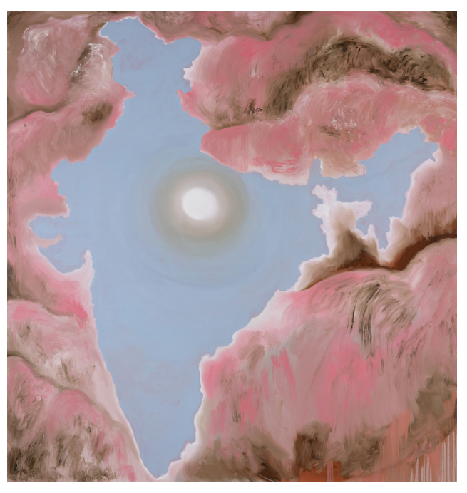
Francesco Clemente, India IV , 2019, oil on canvas, 96 x 92 inches (243.8 x 233.7 cm); © Francesco Clemente: Courtesy the artist and Vito Schnabel Projects

FRANCESCO CLEMENTE: INDIA VITO SCHNABEL PROJECTS, NEW YORK NOVEMBER 8, 2019 - FEBRUARY 15, 2020