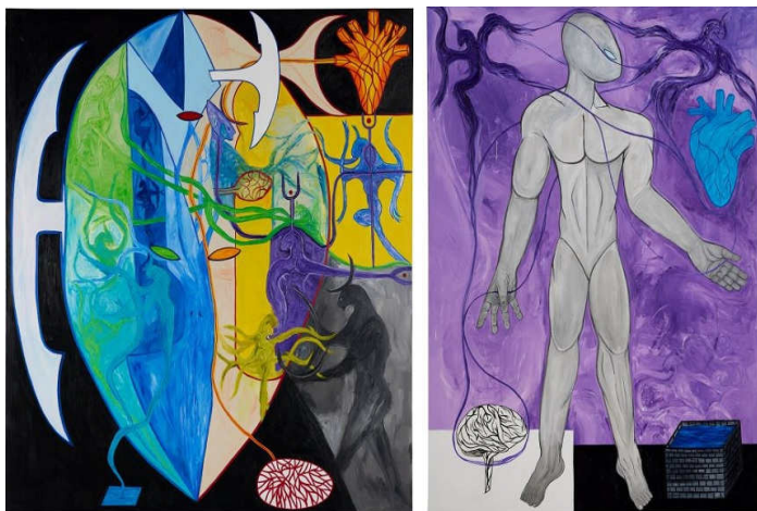
Left: Lance De Los Reyes - Guardian Council VII , 2021. Acrylic on canvas 96 x 84 inches (243.8 x 213.4 cm) © Estate of Lance De Los Reyes / Right: Lance De Los Reyes - The Work of Boaz , 2021. Acrylic on canvas 84 x 60 inches (213.4 x 152.4 cm) © Estate of Lance De Los Reyes

Through his paintings, De Los Reyes left behind an arcane text for decoding that also pays respects to his artistic predecessors, such as his mentor and friend Donald Baechler, who supported De Los Reyes throughout his career. Reyes's work is highly personal, expressive of his innermost beliefs and feelings, presented in exciting combinations of forms and colors.