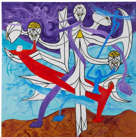
Lance De Los Reyes - Untitled , 2021.1. Acrylic on canvas, 82 x 88 inches (208.3 x 223.5 cm) © Estate of Lance De Los Reyes

De Los Reyes's art is filled with abstract and figural elements, such as ritual masks, forms resembling stylized images of the brain, veins and lines, and complex, interconnected forms resembling totems. Difficult to decipher, the works reverberate with power and energy that is sensed on an instinctive level.