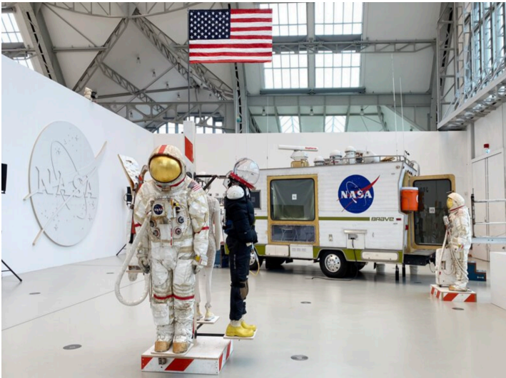
'space program: rare earths' welcome center, past the entrance of the deichtorhallen

by Sofia Lekka Angelopoulou September 24, 2021