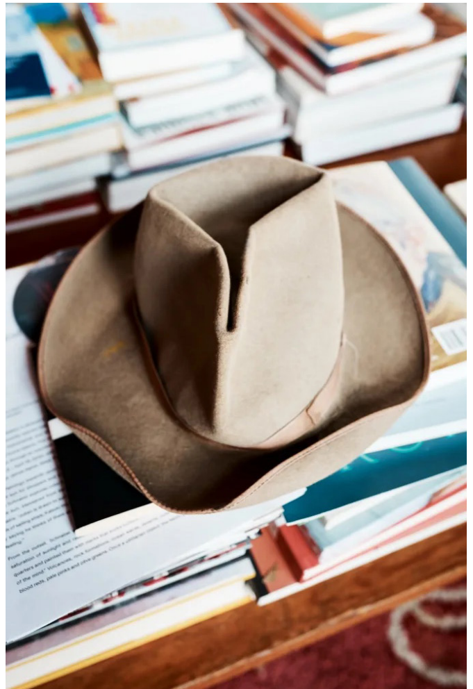
His hat