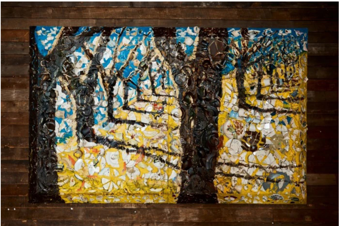
Trees of Home (For Peter Beard) 7, 2020 © Julian Schnabel

In the meantime, he is bunkering down with those who know and love him. He keeps plenty of his own work close, hung on the walls at home, where his skill is applauded and where he can reflect on the past, when those who mattered got him, when they were all on the same page. The crowd doesn't affect him now, he insists. As a young man he felt "an emotional and a personal need for other people. Maybe you get to a point when you need them less and less, and maybe you are speaking to people who are dead."