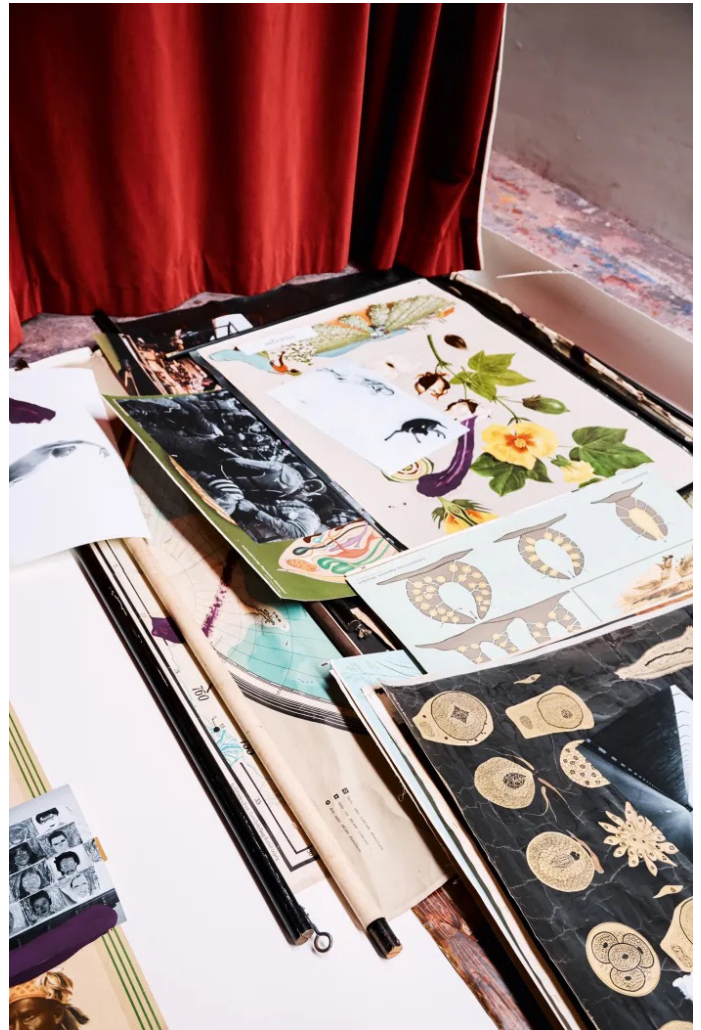
Reference source material for an upcoming project

realistically depict the physical world ever could." "That last part is pretty good, right?" Schnabel says. To Schnabel, this is a defence against the idea that art should argue. "Describing something doesn't necessarily solve it. Making something that has some kind of parallel equanimity to that thing, in and of the form, is probably more useful."