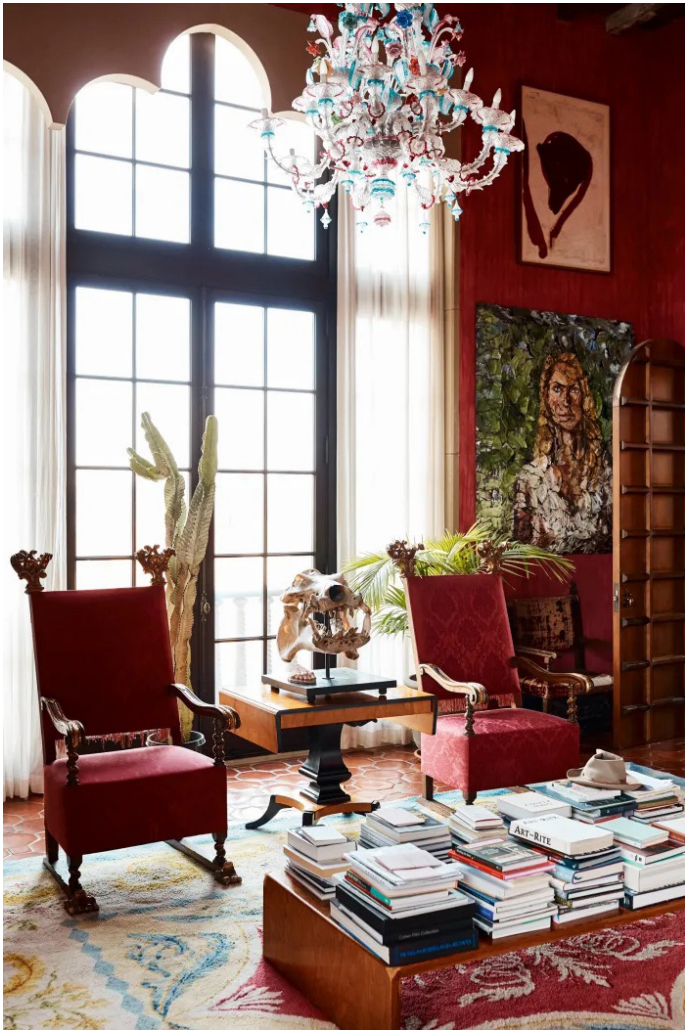
His living room