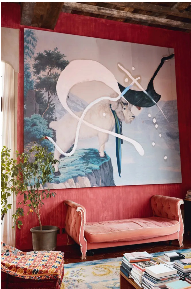
Schnabel's living room, with Wild Potato, 2013 © Artwork: Julian Schnabel.