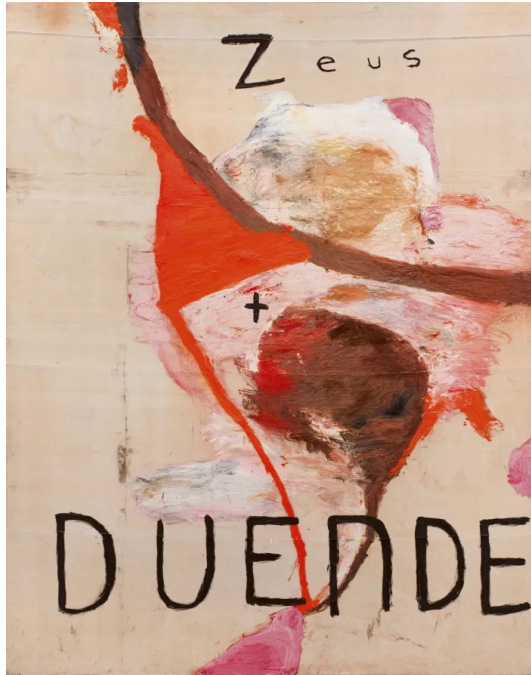
Untitled (Zeus and Duende), 1993