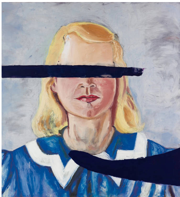
Large Girl with No Eyes, 2001 © Julian Schnabel

Today, the “controversial” tag is, I’d argue, less and less about art-world wrangling and ever increasingly about Schnabel’s personhood, and the narrative framework he has carved out. Some of it is affected and clichéd - the partying; the wearing of pyjamas to important events; the erection of a colossal pink home, based on a Venetian palace, in New York City, which he refers to as Palazzo Chupi. And some of it is innate: his maleness, his whiteness, and his confidence, the innateness of which is, of course, impossible to separate from the maleness and the whiteness. Schnabel has, to borrow his own words, become a new kind of “emblem” of a certain art-world figure that many see as a symbol for the problematic habits and hierarchies of the entire industry. He is a “master”, an artist with a capital A, an ‘80s poster boy for glitz and wealth and braggadocio.