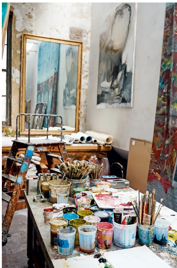
Inside Schnabel's studio

The self-belief required to pivot from artist to unsolicited political speechwriter is typical of Schnabel, a man who has built a career on the conviction that he can do anything, and do it better than anyone else. He has made paintings. He has made sculptures. He has written books. He has directed films, including The Diving Bell and the Butterfly , which won two Golden Globes, and the recent van Gogh biopic At Eternity's Gate , starring Willem Dafoe.