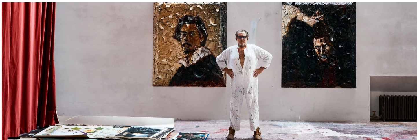
Julian Schnabel in his studio with Self-Portrait of Caravaggio, 2019, and Self-Portrait of Caravaggio as Goliath, 2020

Boisterous, bombastic and filled with braggadocio. On the publication of a super-sized new monograph, the artist is as combustible as ever.