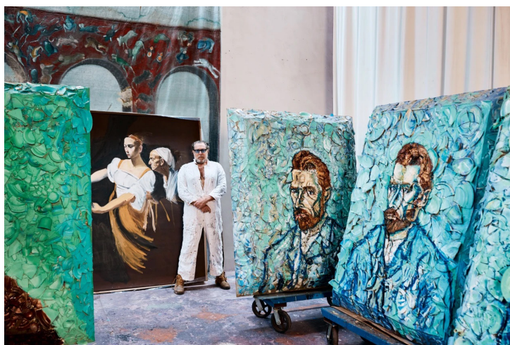
Schnabel with van Gogh Self-Portraits

All of these achievements have been brought together in a new monograph, published by Taschen, which is enormous (44cm x 33cm) and costs £750. It is a fitting partnership between a publisher that correlates scale with significance, and an artist whose obsession with size is so renowned it has almost become a performance, a parody of the male ego. A Schnabel canvas - one of his signature plate paintings, full of thick, gorgeously gloopy layers of pigment, or a work rendered over used tarpaulin, found in a Mexican fruit market - can come in at over 6m, and he has hung them on the outside of buildings in order to accommodate the scale. As well as enormity, Schnabel's art tends to build upon found materials as its starting point, taking things that have a history of their own before they become part of the painting. Hence the crockery, or the sheeting, some of which was studio material first - say, used to cover a painting - and became a canvas later. Over this come gestural brushstrokes, or figures, often icons, or wording. Schnabel is interested in how the meaning of symbols can shift or disappear when context is changed; he has made paintings based on the images from psychological tests, or navigational charts, or the letters of different languages.