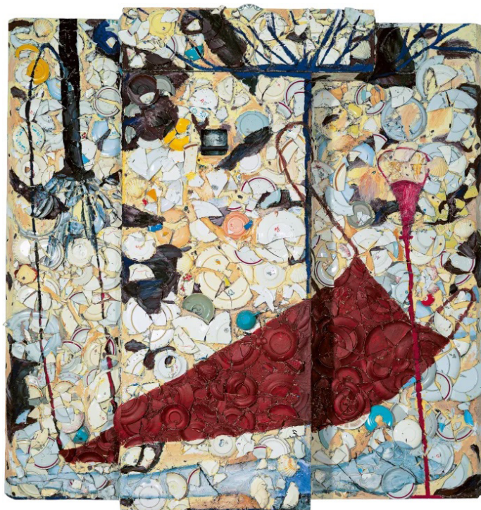
Circumnavigating the Sea of Shit , 1979 © Julian Schnabel

The book has a cover of roses and comes in a weighty pink box that acts as a protective case, surrounding it like a frame when opened. The pink gives the artworks an aura, producing, in Schnabel's words, a "halo around every painting, which goes perfectly with every page". Schnabel has a taste for the godly, for anything transcending mere mortality. The titles of his paintings refer to saints and angels as often as they do celebrity subjects and famous artists. A week or so before our interview, he was at his studio in Montauk, painting outside in the cold, without a coat. "I don't feel cold. You just forget about your body, you forget about everything somehow," he says. In 1977 Schnabel called a work I Don't Want to be King, I Want to be Pope .