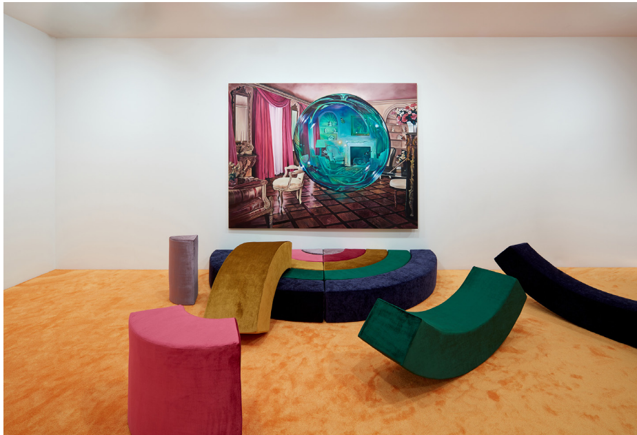
Ariana Papademetropoulos Unweave a Rainbow . Exhibition view at Vito Schnabel Projects, New York, 2020.

by Alexandre Stipanovich January 8, 2021