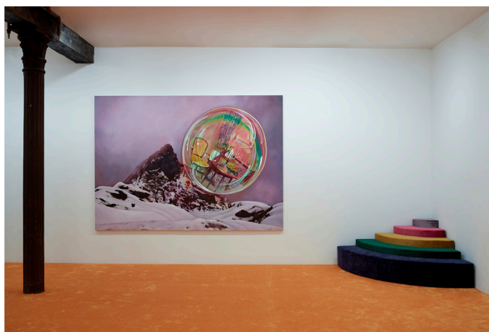
Ariana Papademetropoulos Unweave a Rainbow . Exhibition view at Vito Schnabel Projects, New York, 2020. Photography by Argenis Apolinario. © Ariana Papademetropoulos. Courtesy of the artist and Vito Schnabel Projects, New York.