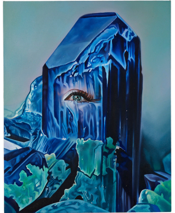
Ariana Papademetropoulos, Spying on Zeus was never a good idea , 2020. Oil on canvas. 20 x 16 in. © Ariana Papademetropoulos. Courtesy of the artist and Vito Schnabel Projects, New York.