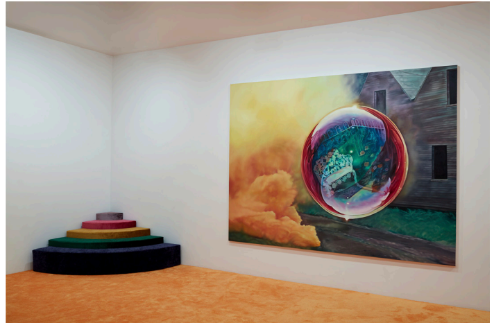
Ariana Papademetropoulos Unweave a Rainbow . Exhibition view at Vito Schnabel Projects, New York, 2020. © Ariana Papademetropoulos.