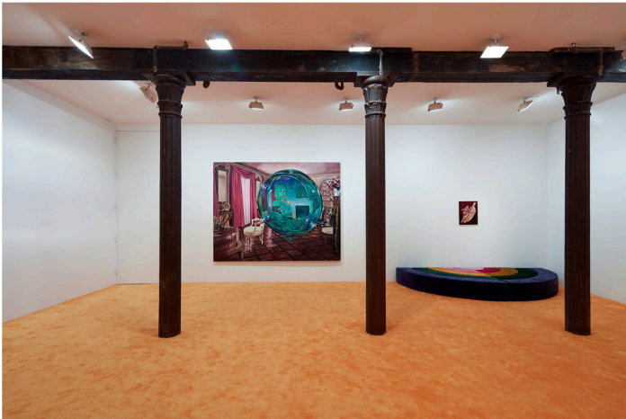
Ariana Papademetropoulos Unweave a Rainbow . Exhibition view at Vito Schnabel Projects, New York, 2020.