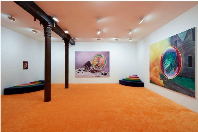
Ariana Papademetropoulos Unweave a Rainbow . Exhibition view at Vito Schnabel Projects, New York, 2020. Photography by Argenis Apolinario. © Ariana Papademetropoulos. Courtesy of the artist and Vito Schnabel Projects, New York.