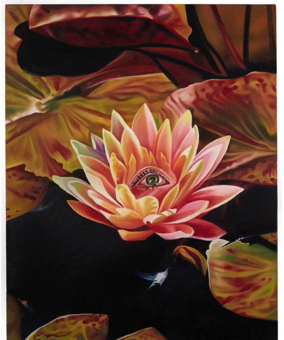
Ariana Papademetropoulos, Keira , 2020. Oil on canvas. 20 x 16 in. © Ariana Papademetropoulos. Courtesy of the artist and Vito Schnabel Projects, New York.