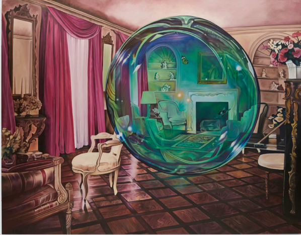
Ariana Papademetropoulos, Curse of the Boys with Butterfly Tattoos , 2020. Oil on canvas. 84 x 108 1/2 in. © Ariana Papademetropoulos. Courtesy of the artist and Vito Schnabel Projects, New York.