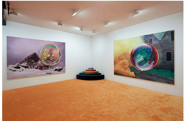
Ariana Papademetropoulos Unweave a Rainbow . Exhibition view at Vito Schnabel Projects, New York, 2020. Photography by Argenis Apolinario. © Ariana Papademetropoulos. Courtesy of the artist and Vito Schnabel Projects, New York.