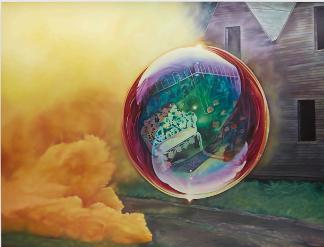
Ariana Papademetropoulos, Espulsione dalla discoteca , 2020. Oil on canvas. 90 x 120 in.