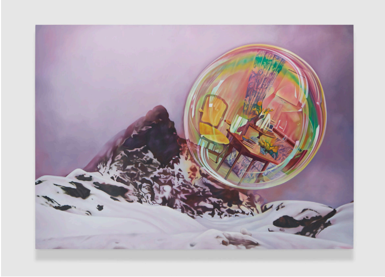
Ariana Papademetropoulos, The Shadow of Clouds , 2020. Oil on canvas. 84 x 120 in. © Ariana Papademetropoulos. Courtesy of the artist and Vito Schnabel Projects, New York.