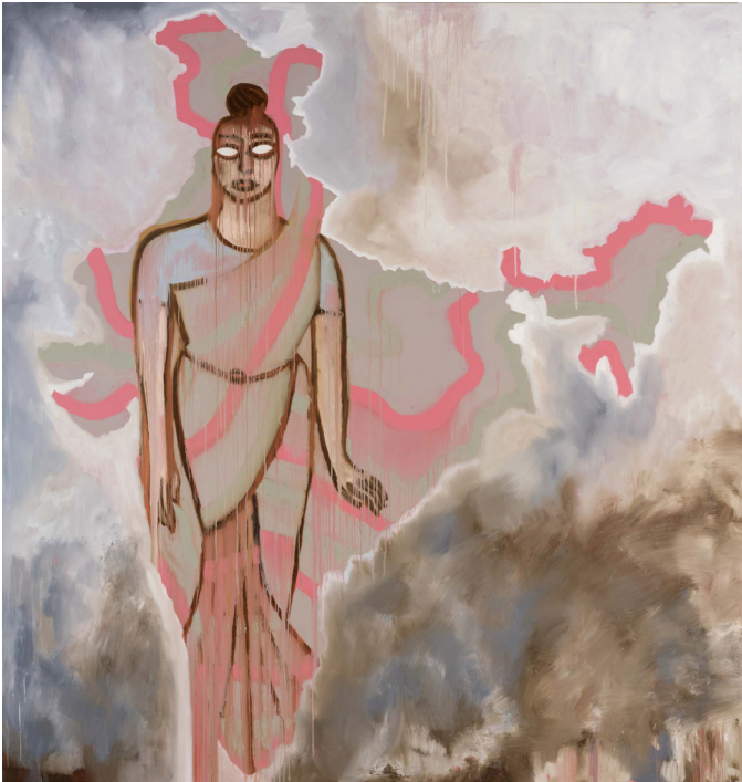
Francesco Clemente, India II , 2019, oil on canvas, 96 x 92 inches (243.8 x 233.7 cm); © Francesco Clemente; Courtesy the artist and Vito Schnabel Projects