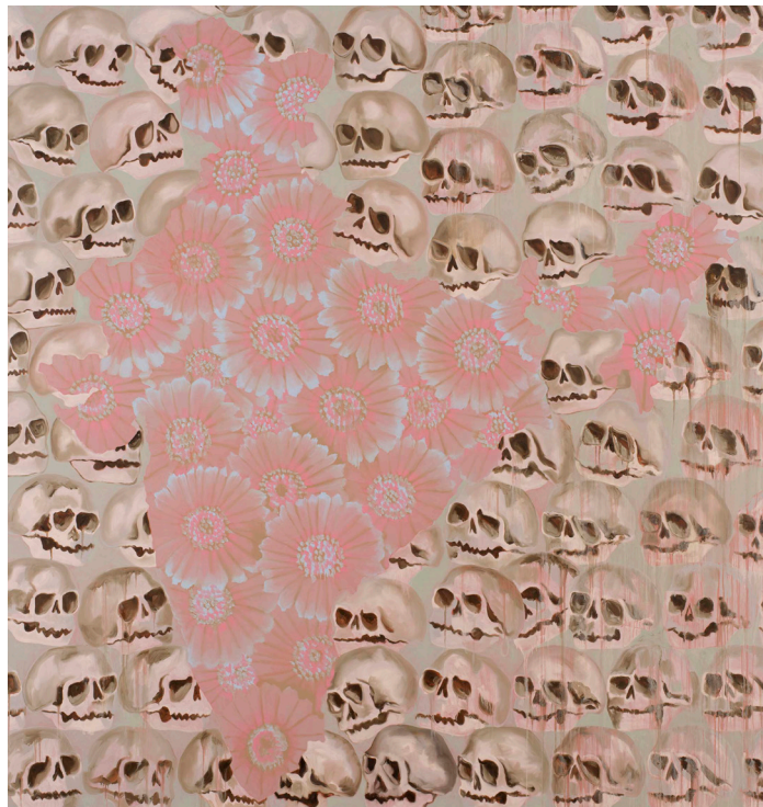
Francesco Clemente, India I , 2019, oil on canvas, 96 x 92 inches (243.8 x 233.7 cm); © Francesco Clemente; Courtesy the artist and Vito Schnabel Projects

Flowers resembling marigolds form the ancient diamond shaped outline of a map of India, which marries with a background of dozens of skulls gazing at the map, all awash in soft pink.