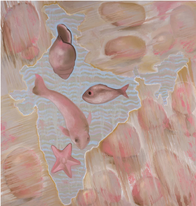
Francesco Clemente, India III , 2019, oil on canvas, 96 x 92 inches (243.8 x 233.7 cm); © Francesco Clemente; Courtesy the artist and Vito Schnabel Projects

Elected to the American Academy of Arts and Letters in 2010, Clemente's work is part of global museum collections such as the Art Institute of Chicago; Miami Art Museum; Kunstmuseum Basel; Solomon R. Guggenheim Museum, Bilbao and New York; The Metropolitan Museum of Art, New York; The Museum of Modern Art, New York.