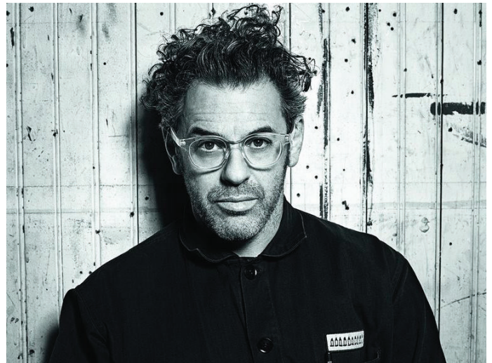
Portrait of Tom Sachs.