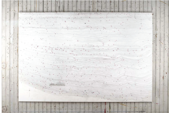
Tom Sachs: Wall Drawing Number One , 2017. Synthetic polymer paint, pencil on plywood 48 x 72 x 3/4 inches (121.9 x 182.9 x 1.9 cm). © Tom Sachs; Photo by Genevieve Hanson; Courtesy Tom Sachs Studio and Vito Schnabel Gallery.

One of the critically acclaimed contemporary artists best known for his diverse, yet the cohesive artistic practice is an American artist Tom Sachs. For the last three decades, he has been producing hybrid works somewhere in between readymade, sculpture in extended field and installation. As a matter of fact, Sachs managed to construct a specific aesthetic in which brand icons, symbols of Modernist utopianism, and commodities of capitalist culture become one. By exposing their making process, Sachs questions the notions of authenticity and ephemera in order to reveal the perfidy of the capitalist market.