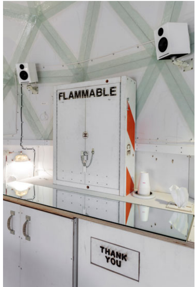
A view of the Chanel Make up counter while the make up cabinet is closed. Building #3 by Tom Sachs, 2018. Mixed media installation, 158 x 249 x 243 inches. © Tom Sachs. Courtesy the artist and Vito Schnabel Gallery. Photography © Joshua White - JWPictures.com.