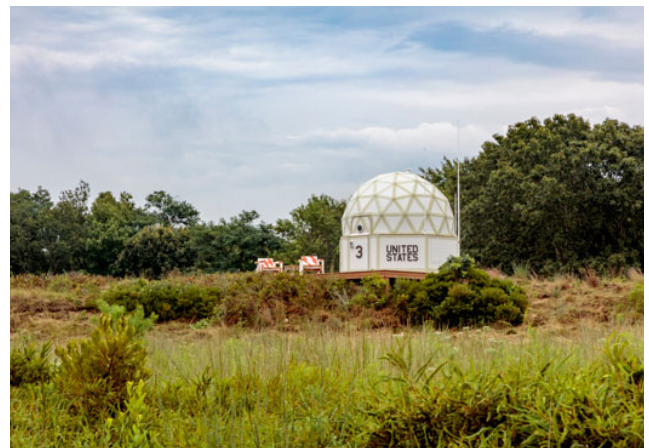
Building #3 by Tom Sachs, 2018. Mixed media installation, 158 x 249 x 243 inches. © Tom Sachs. Courtesy the artist and Vito Schnabel Gallery. Photography © Joshua White - JWPictures.com.