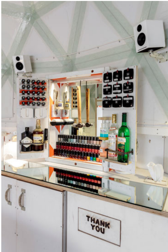
The Chanel Make Up counter in Building #3 by Tom Sachs, 2018. Mixed media installation, 158 x 249 x 243 inches. © Tom Sachs. Courtesy the artist and Vito Schnabel Gallery. Photography © Joshua White - JWPictures.com.