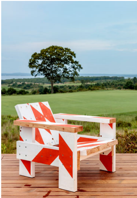
Building #3 by Tom Sachs, 2018. Mixed media installation, 158 x 249 x 243 inches. © Tom Sachs. Courtesy the artist and Vito Schnabel Gallery. Photography © Joshua White - JWPictures.com.