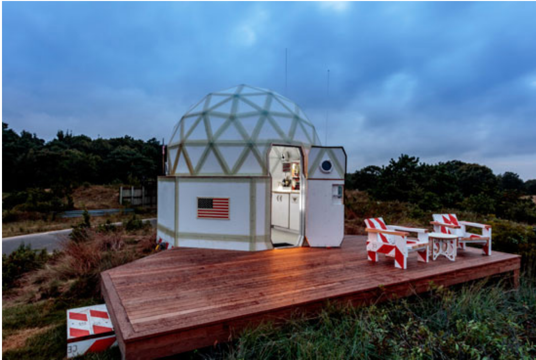
Building #3 by Tom Sachs, 2018. Mixed media installation, 158 x 249 x 243 inches. © Tom Sachs. Courtesy the artist and Vito Schnabel Gallery. Photography © Joshua White - JWPictures.com.

The juxtaposition was delicious: an inhabitable sculpture leaping from the concept of affordable mass-produced housing sited atop a hilly slope on the grounds of the most exclusive private club in The Hamptons. Of course, this was no ordinary sculpture and its concept wasn't inspired by HUD but by Buckminster Fuller on the democratization of architecture through his Geodesic Dome.