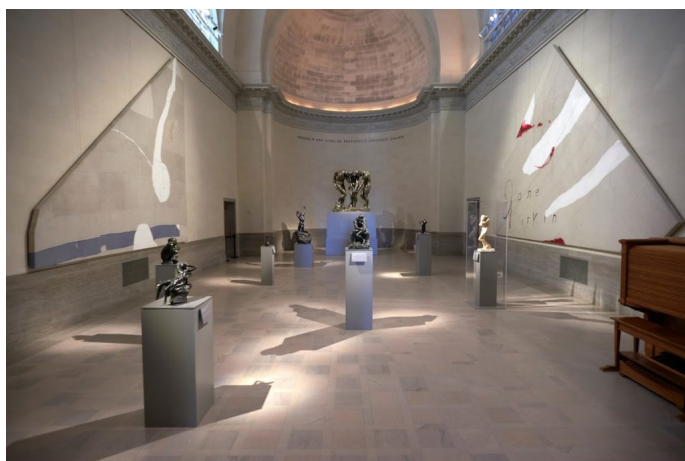
Installation views of Julian Schnabel: Symbols of Actual Life at the Legion of Honor in San Francisco.

For paintings from his Jane Birkin series (1990), he used sailcloth that he acquired from sailors in Egypt and shaped into felucca sails. Their boat’s name happened to be Jane, which brought to mind for him the famed singer and actress, and he was moved to paint her name onto the sail along with abstract marks.