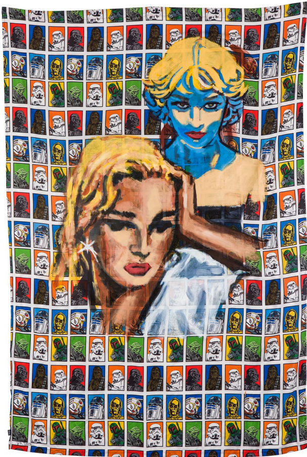
Champagne Run , 2017, acrylic on bed sheet.