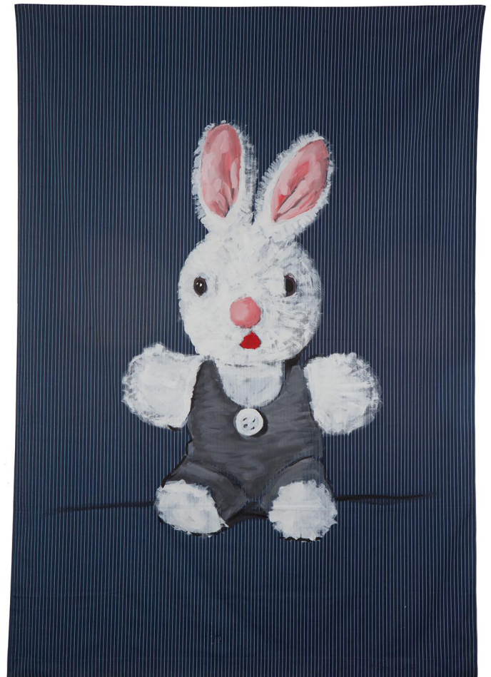
Bunny , 1986, acrylic on bed sheet.