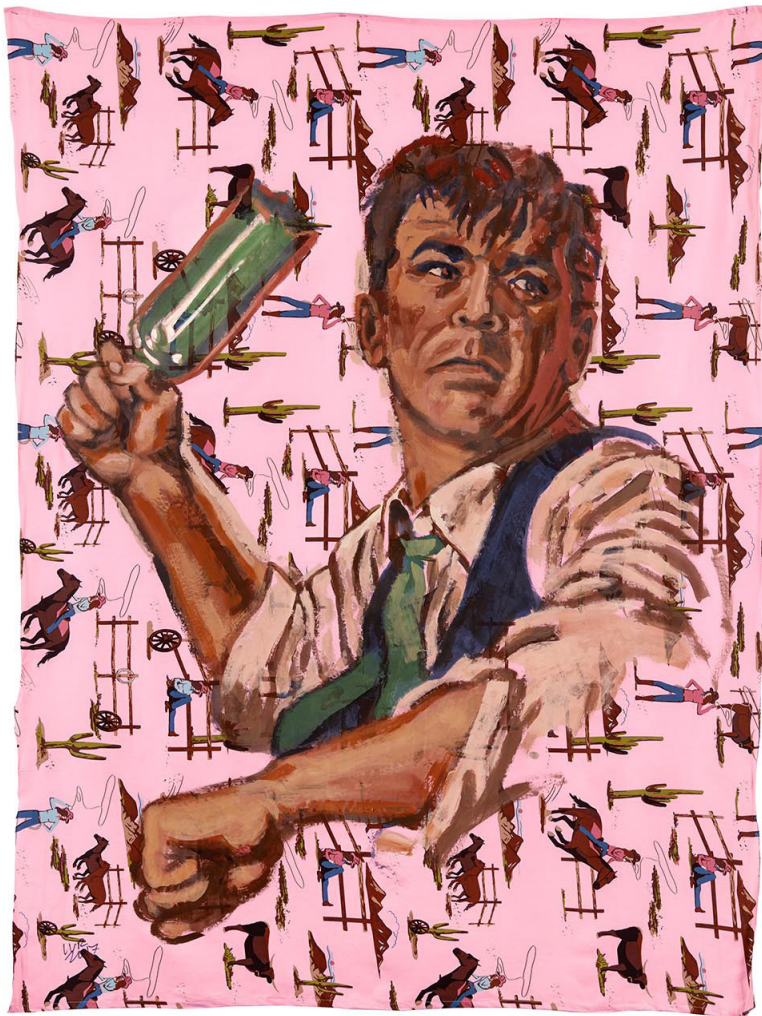
As Tough As They Come , 2017, acrylic on bed sheet.

"Bed sheets serve as an almost universal accessory to elemental manifestations of desire. Also amusing is the thought that bed sheets are horizontal in the dark and hung vertical to dry in the sunshine. Nature is horizontal and culture is vertical, and a patterned bed sheet introduces the whimsical curlicues of the social imagination into the horizontal biological realm. The bed sheet is also a metaphor for the continuous field of consciousness."