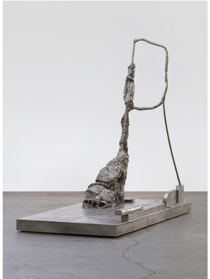
Sterling Ruby, Modern Hiker , 2017

"Maybe it's a bit easier right now to visualise the end, I would say that people have been predicting the apocalypse for a very long time," he said. "I feel that drive particularly strongly in the locations that I am most drawn to—Los Angeles has it, and so does St. Moritz."