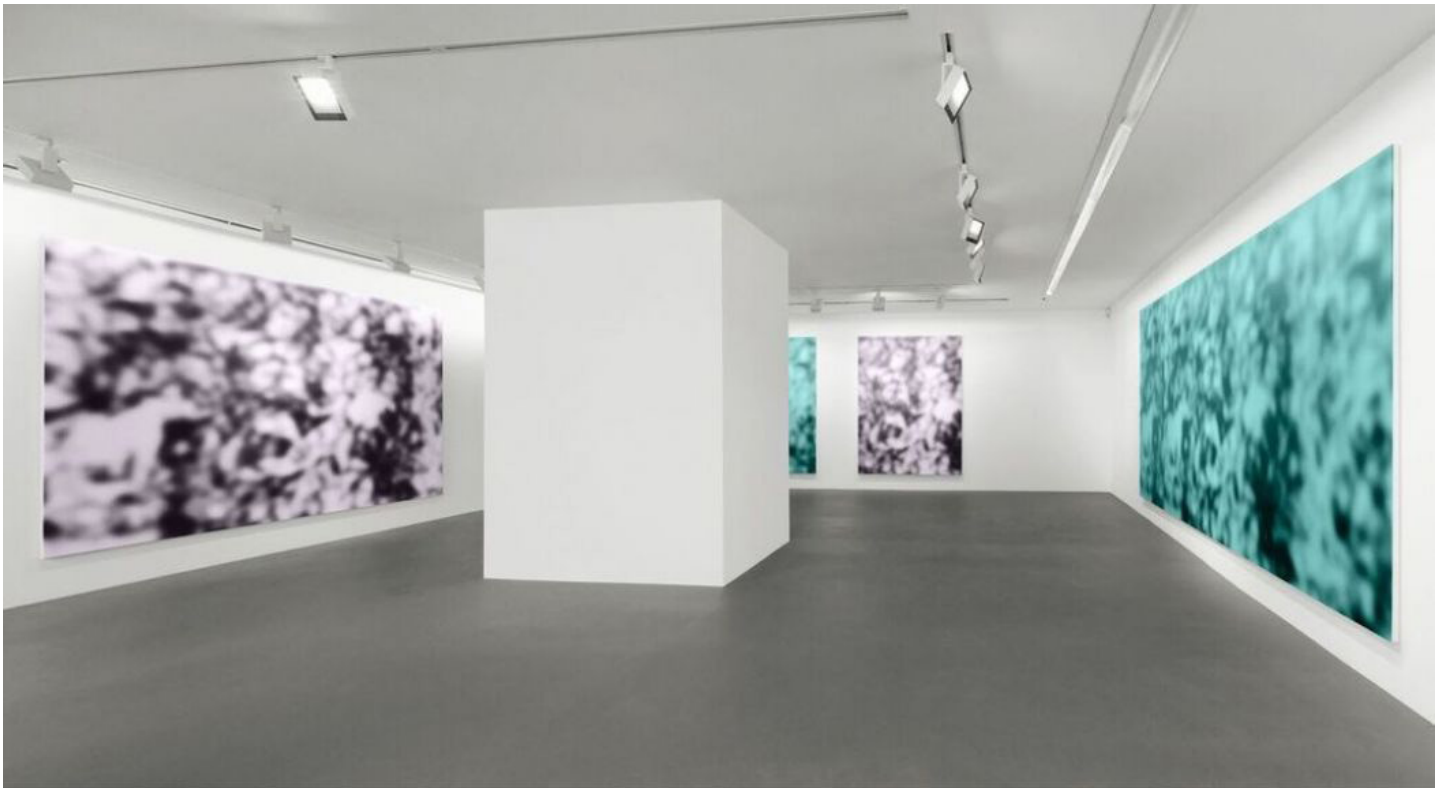
Works from the exhibition, 'Figment' on view at Vito Schnabel Gallery © JEFF ELROD; COURTESY OF THE ARTIST AND LUHRING AUGUSTINE, NEW YORK AND VITO SCHNABEL GALLERY. PHOTO BY STEFAN ALTENBURGER.

Vito Schnabel Gallery, St. Moritz, Switzerland is hosting the works of American abstract painter Jeff Elrod (born 1966) through January 22, 2017 in the exhibition titled 'Figment'.