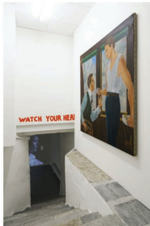
McDermott & McGough