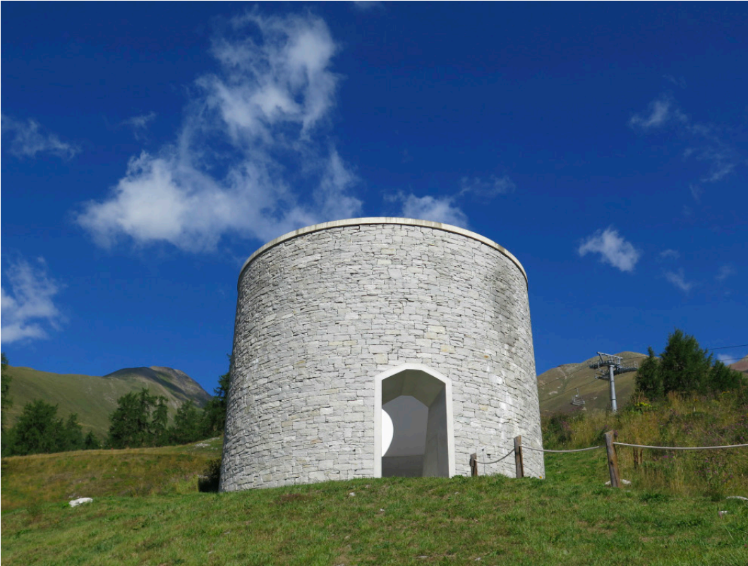
James Turrell Skyspace Piz Utèr Hotel Castell Zuoz(2005).